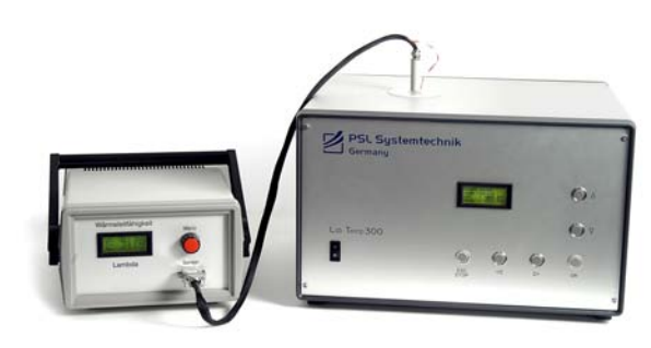
Lambda with LabTemp 300 - for high temperatures

Due to the very high speed of the thermoelectric heating/cooling and the extreme temperature homogeneity of the LabTemp 30190 short measuring times are achieved, thereby the measuring frequency is increased significantly. Only small volumes of sample (approx. 45 ml) are sufficient to execute reliable measurements.