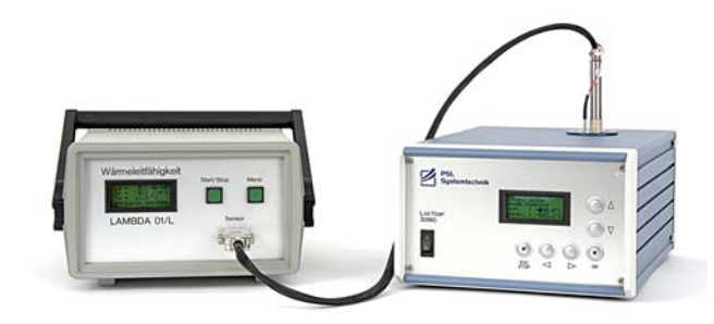
Measuring System Lambda with LabTemp 30190